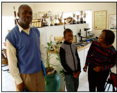
A Happy Smiling Client