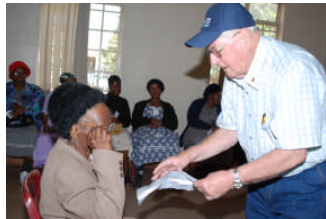
Senior citizen receiving her prescription spectacles