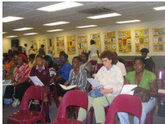
Patients waiting to have their eyes tested