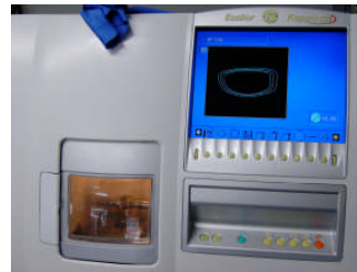
Laboratory—Cutting prescription lenses

There it processes the received scripts and distributes the completed recycled spectacle frames with newly fitted 100% prescription lenses countrywide and beyond the neighboring borders.