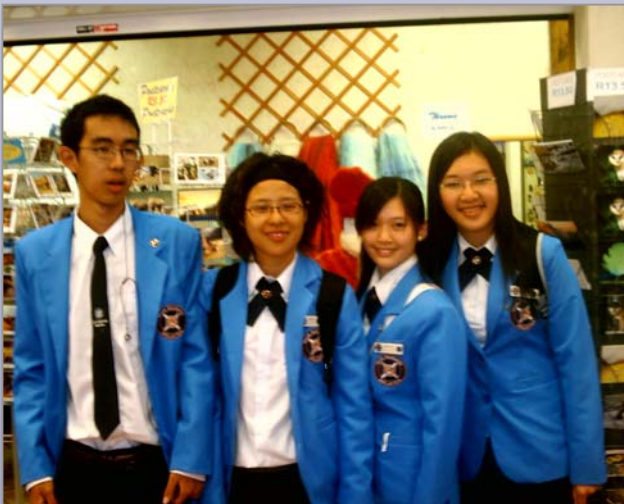
Exchange students from Malaysia