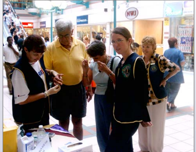
Durban South & Pinetown with Netcare conducted a successful diabetes drive