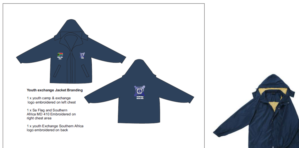
Official Southern Africa Youth Exchange jacket

Students are requested to wear it at all times especially when arriving at the Airports and at official functions.